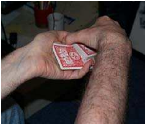
Photo 10 card ready to be palmed

From here, you have two options: you can palm the card as you apparently square the deck and place in your left hand, hiding the palmed card, or you can palm it as you give the deck to the spectator, or place it on the table.