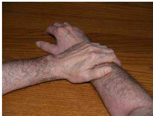
Photo 11 holding out a palmed card in my left hand

Your second option is much easier. From the position in photo 10, all you have to do is move the whole deck to the right to disengage the card from the deck, leaving the card palmed in your left hand. My favorite position for holding out a palmed card looks like this: