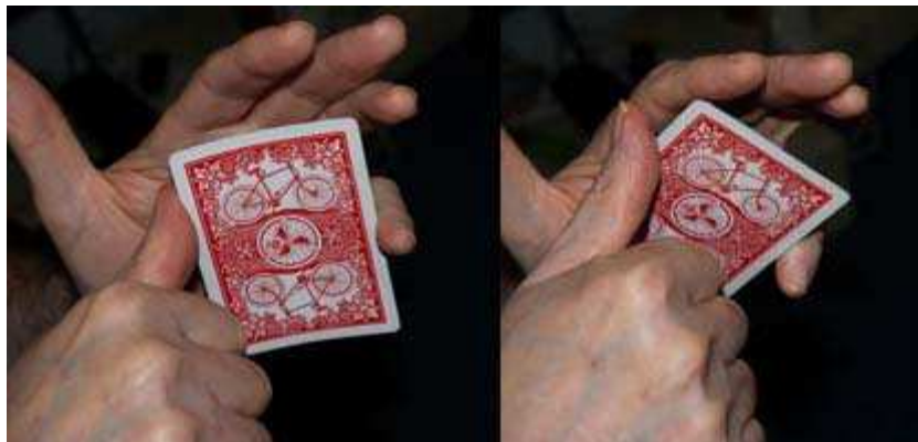
Photo 4, 5. Right fingers curled for visibility purposes

Notice that by moving your thumb clockwise and your pinky a little into your palm, you can position the card directly over your left palm.