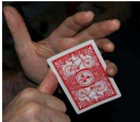
Photo 3. Right fingers curled for visibility purposes.

You should now be able to hold the card with your right thumb and left pinky (although you won't actually need to do that when you use the whole deck, it's important that you get the feel of holding the card this way).