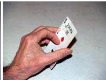
Bottom view. Left index finger supports the selection..