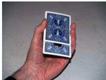
Card is apparently inserted into The middle of the packet.

Take the holey selection at the back end. Pretend to put it face down among the cards in your left hand, but really put it at the bottom. As you apparently insert the card, use your left index finger to support it.